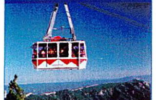
Breathtaking Views of the Sandia Mountains