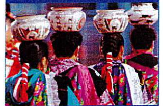
Native Southwestern Culture and Crafts