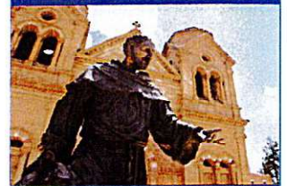
St Francis Cathedral in Santa Fe

Day 11: Today After enjoying a Continental Breakfast, you will depart for home... a perfect time to chat with your friends about all the fun things you've done, the great sights you've seen, and where your next group trip will take you!