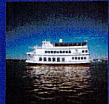
Cruise Around Charleston Harbor