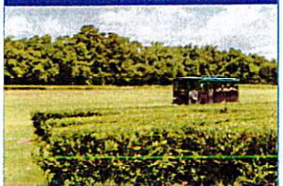
Tour Charleston Tea Gardens