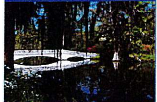
Take in the Picturesque Views of Charleston

Day 7: Enjoy a Continental Breakfast before departing for home... a perfect time to chat with your friends about all the fun things you've done, the great sights you've seen and where your next group trip will take you!