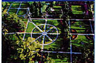
Visit Middleton Place and Gardens